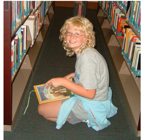
Every Thursday after PE at the armory, students go to the Madison Public Library.